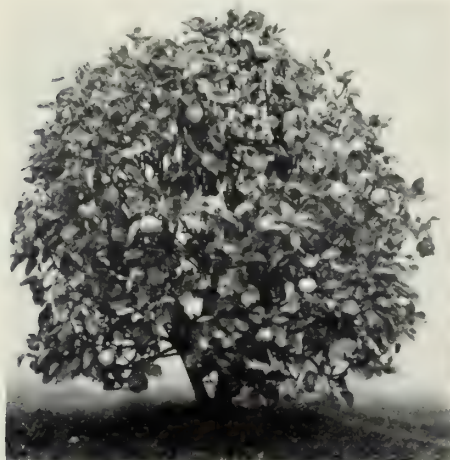
DWARF APPLE—14 Years Old

We have a very good supply of well grown dwarf fruit trees. These trees come into bearing very early—trees planted in the Spring often have fruit in the Fall of the following year. They require very little space. Ten of these trees can be planted in a space about half the size of an ordinary living room. It's not only fun, but profitable to grow dwarfs in your back yard garden. The fruit from these trees is identical in size and all other respects as that grown on standard trees. We have the following varieties.